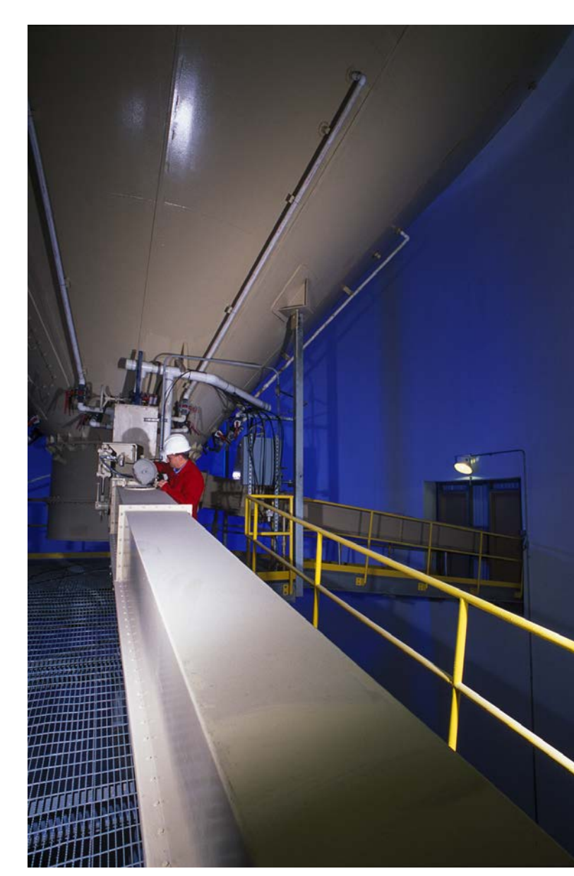
Airslide® gravity conveyor

Polyethylene Polyolefin Polypropylene PVC PPO resin Rutile Silica Slag cement Starch Synthetic gypsum TBBA Un-ground alumina Vitamin C Zinc dust and more