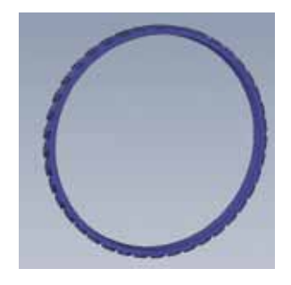
Radial air ring. The swirler is the main mechanism for shaping the flame during start-up and daily operation