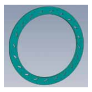
Axial air ring. The rectangular nozzles have a greater surface area than conventional circular nozzles and are at an angle. This facilitates fast and powerful mixing of fuel and hot secondary air