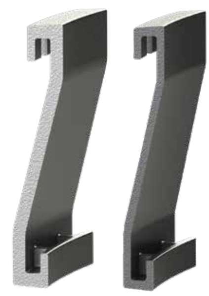
25 mm segment

To prevent mechanical wear caused by quartz particles or other hard and erosive particles, the 25mm segment can be used to upgrade the entire cast central pipe or only parts of it.