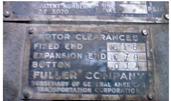
Original 1963 nameplate