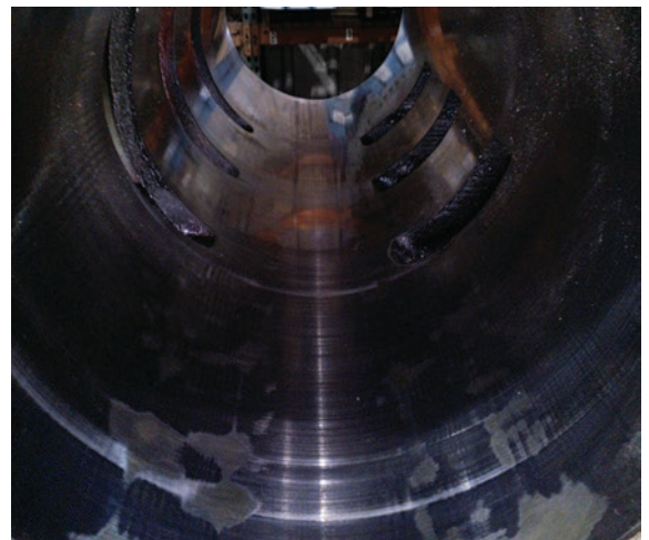
Compressor cylinder shows very minor wear on initial bore