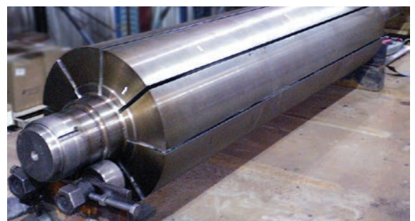
50-year old rotor still in factory condition