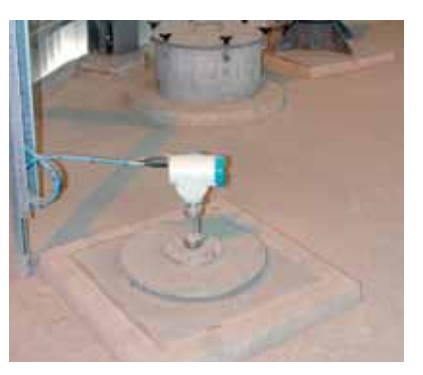
Manhole and nivopilot on top of the silo