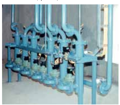
Aeration filter (optional)