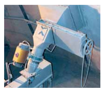
Manhole and nivopilot on top of the silo