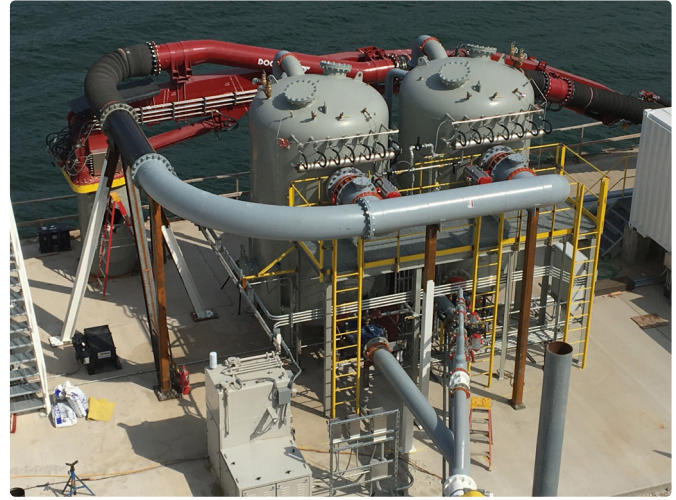
Starting with a range of four basic sizes, FLSmidth Cement can supply the right DOCKSIDER ship unloader for any terminal – whether you're unloading river barges or Handymax bulk vessels, and whether you're conveying to an adjacent belt conveyor or through a 1200 m (4000 ft) pipeline.