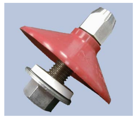
Detail of Fullerator™ aeration/vibration pad