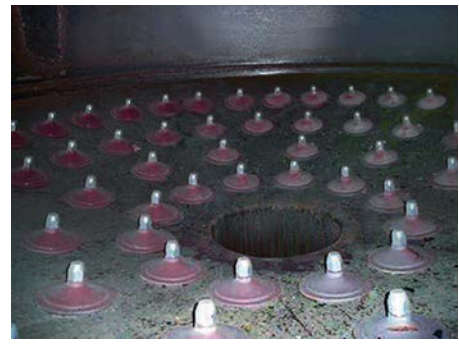
Fluidized bottom using Fullerator aeration/vibration pad