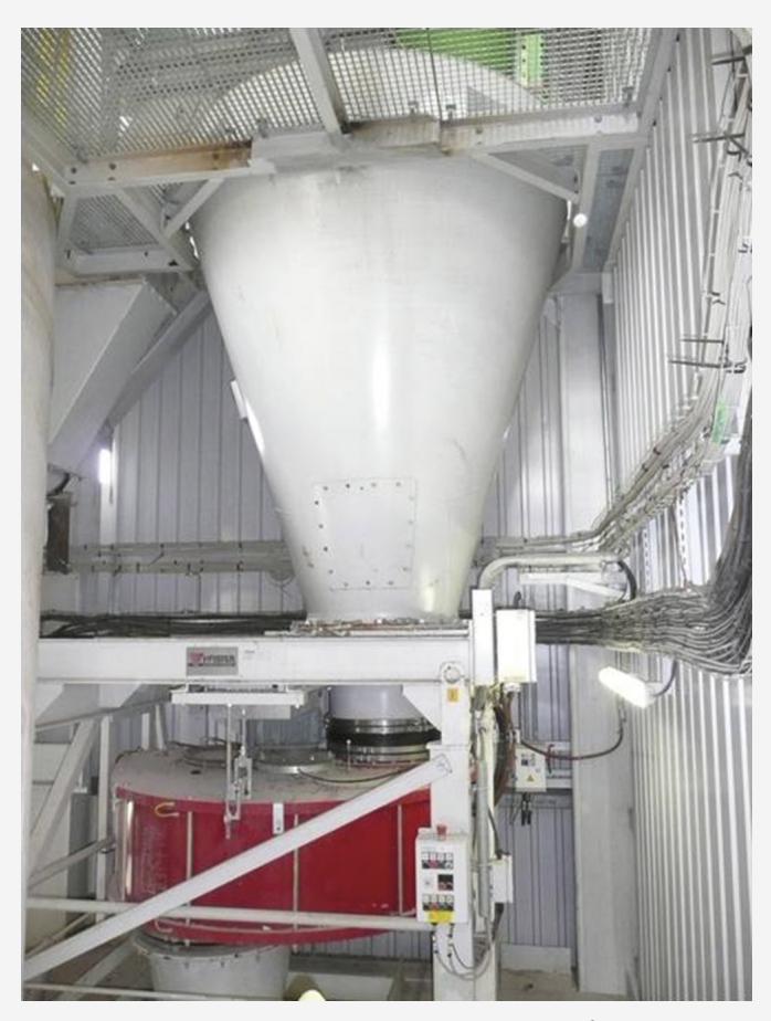
Pfister<sup>®</sup> dosing system