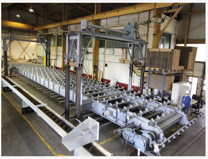
Feedex™ overhead reclaimer