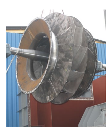
Impeller, delivered pre-assembled

The fan is contained in a single unit and with its relatively few parts, requires minimal installation effort. The impeller, including inlet cone, coupling and bearings, is delivered pre-assembled from FLSmidth's production facilities.